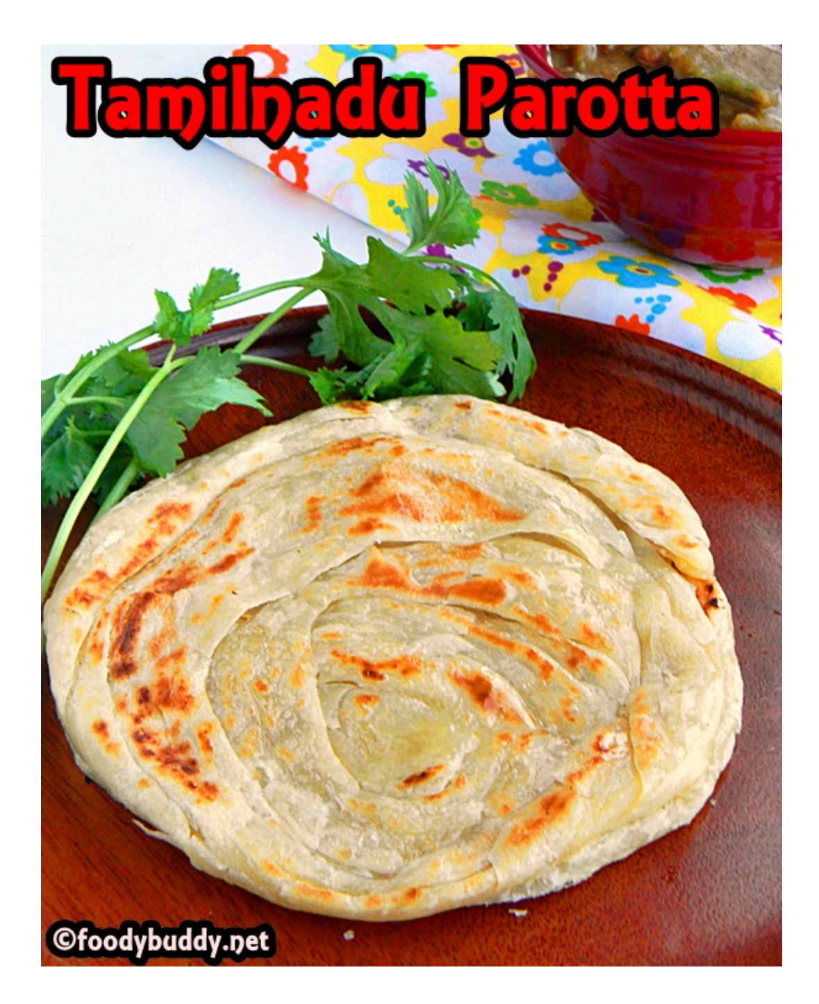
5.0 from 1 reviews Parotta Recipe / How to make Parotta at home