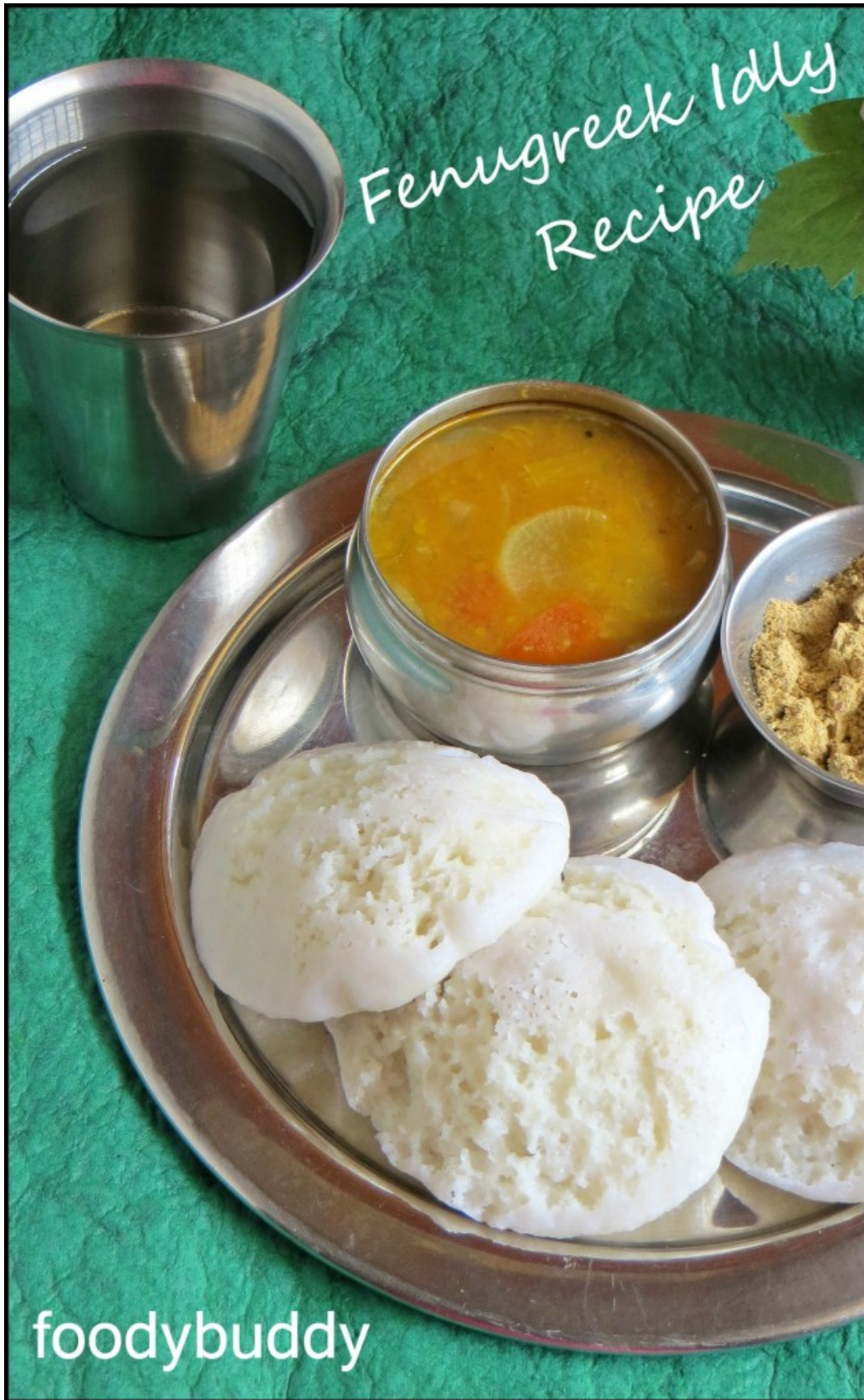
Soft Methi Idly

Technorati tags : vendaya idli , vendhayam idli recipe ,