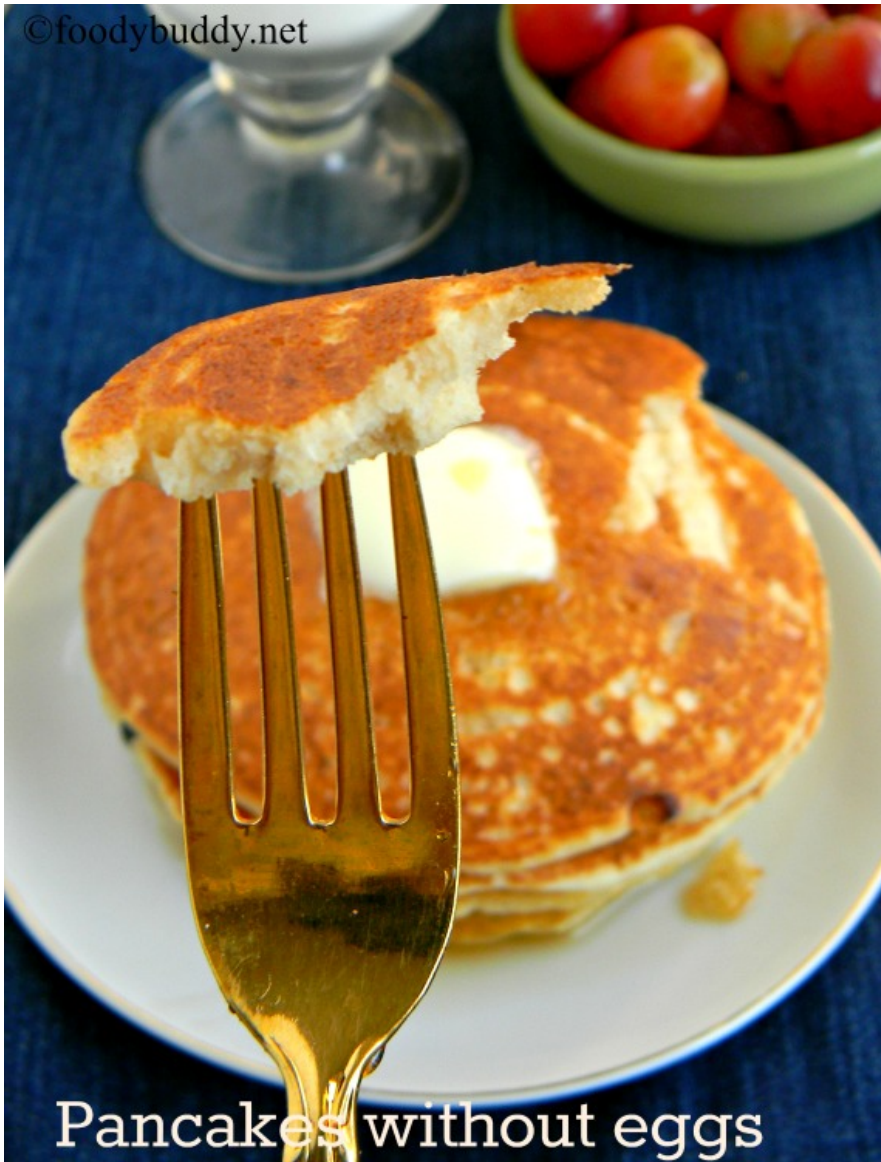
Pancakes without eggs