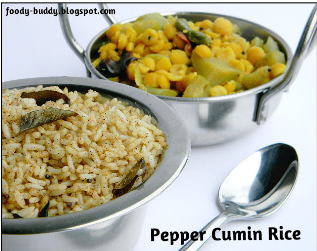
Pepper Cumin Rice