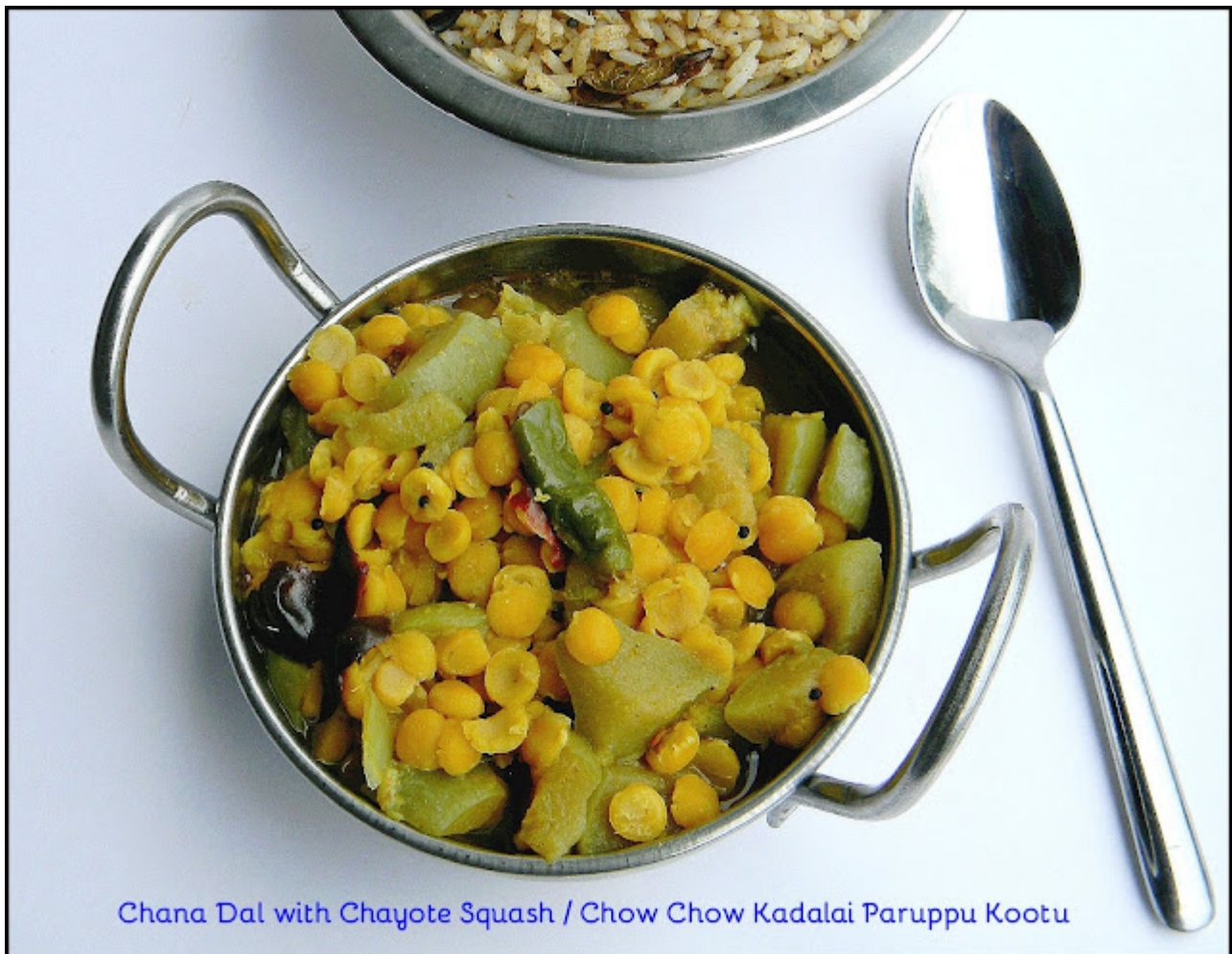
Chana Dal with Chayote Squash / Chow Chow Kadalai Paruppu Kootu