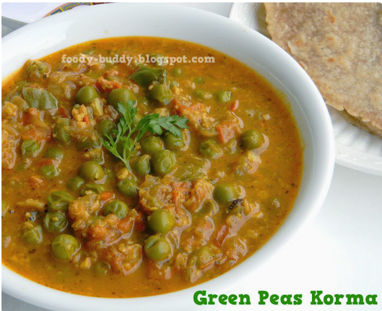
Green Peas Kurma

Today I am sharing my amma signature recipe of Green Peas Kurma which is very close to my heart. My mom makes this pattani kurma at least once a month as side dish for chapathi, phulka and also it tastes good with dosa. I prefer to use frozen peas, you can also substitute it with fresh or dries peas along with potato or any other vegetable of your choice. Coconut, cashews, yogurt along with other aromatic spices are used for this kurma. Addition of mint gives a nice flavor to the dish. You can also make kurma as a side dish for pulao.