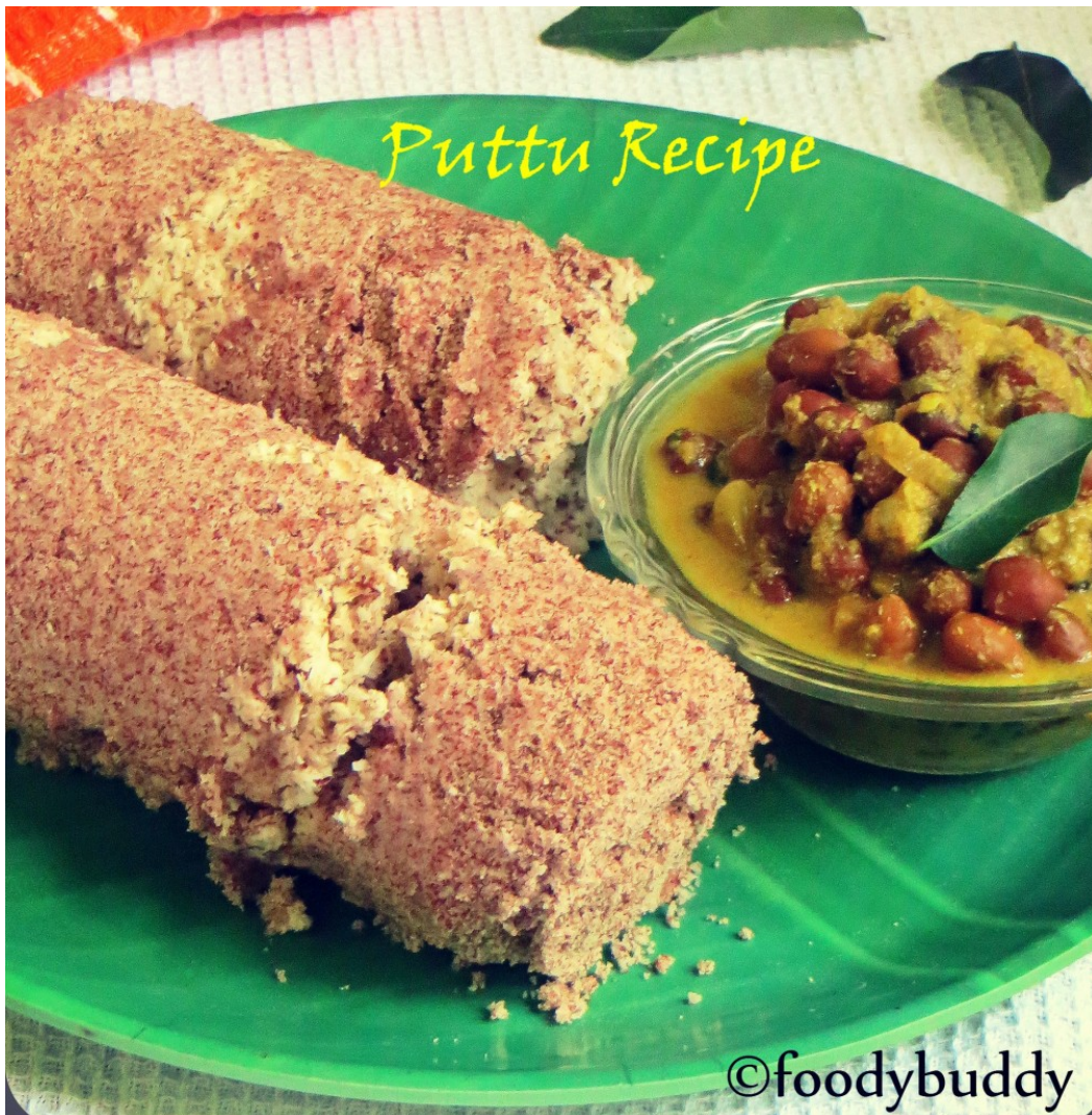
Puttu with kadala curry

Preparation Time : 30 mins +soaking time Cooking Time : 30