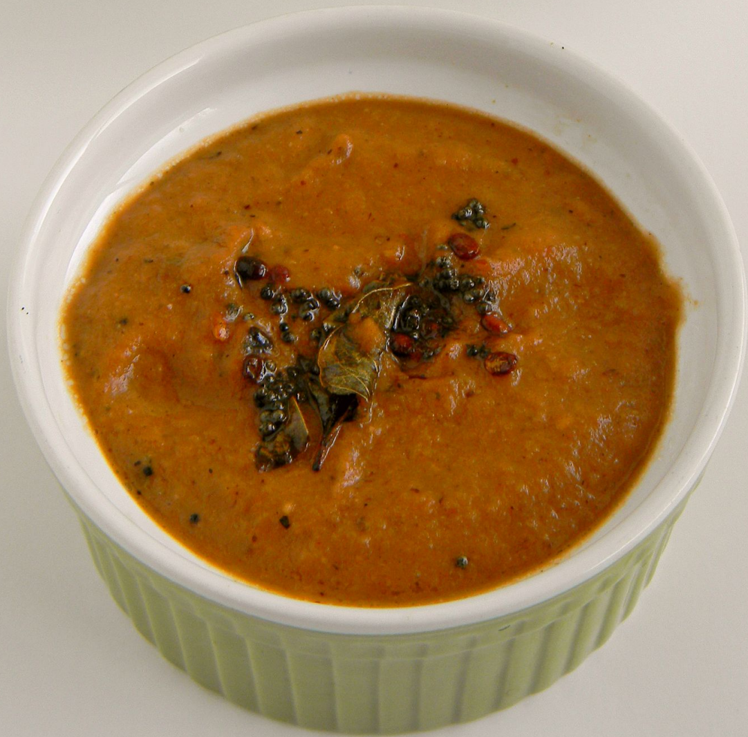
Tomato Chana Dal Chutney