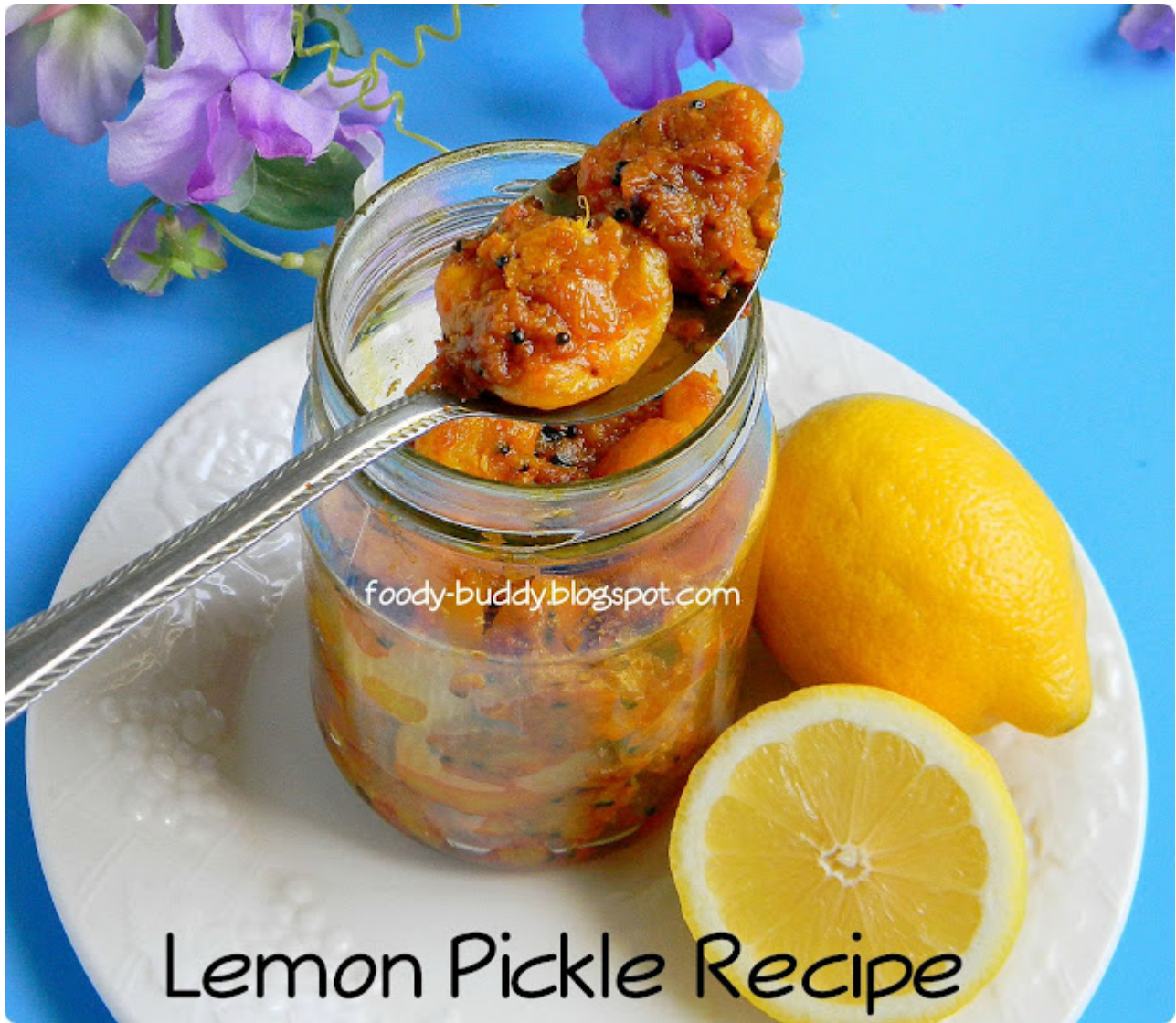
Lemon Pickle Recipe