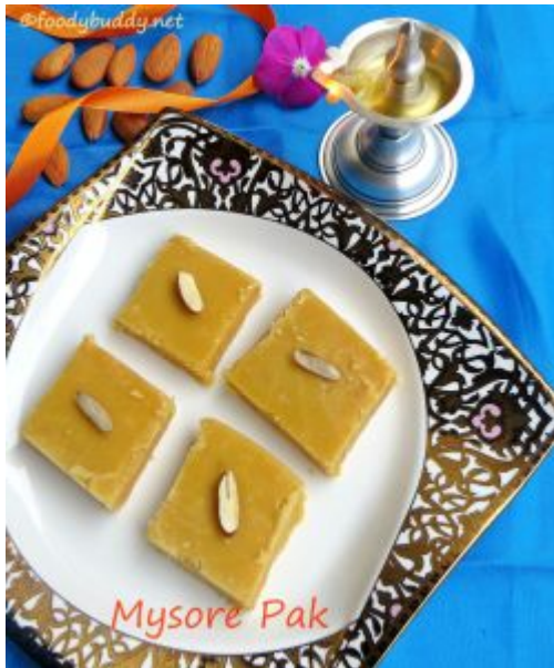
Badam Mysore Pak