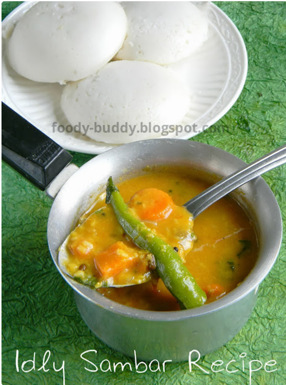
Idly Sambar Recipe