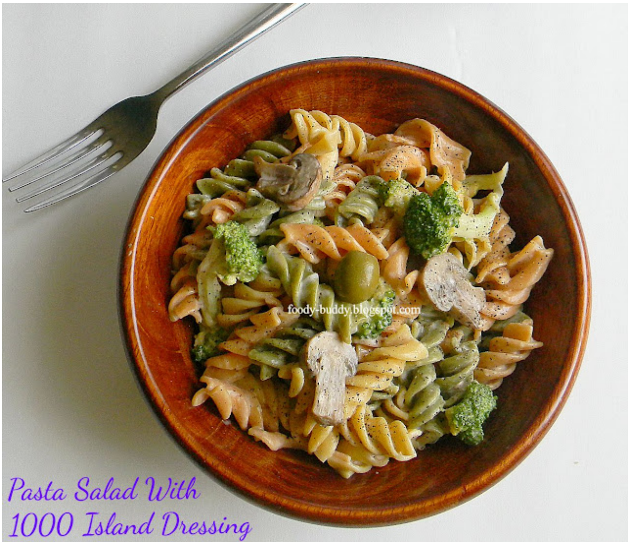
Pasta Salad With 1000 Island Dressing