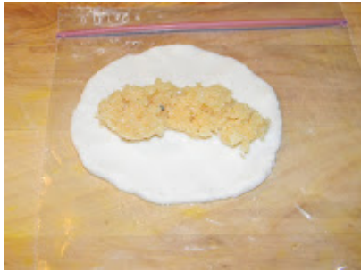
Adding Pooranam in the middle