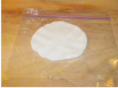
Press the Dough like this