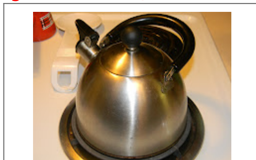
Boiling Water in Kettle

Put the rice flour in a kadai and dry fry till nice aroma comes out. Remove from stove and keep aside. Boil 1 and 1/2 to 2 Cups of water along with salt and 2 teaspoon of Ghee/oil. Pour this boiling water in the fried rice flour slowly like drop by drop, then mix it using a wooden spoon. When it is warm enough to handle, knead it with your hand.