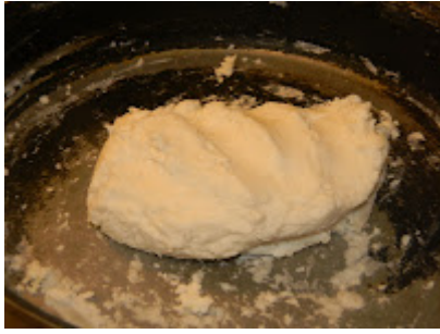
Making of Outer Dough