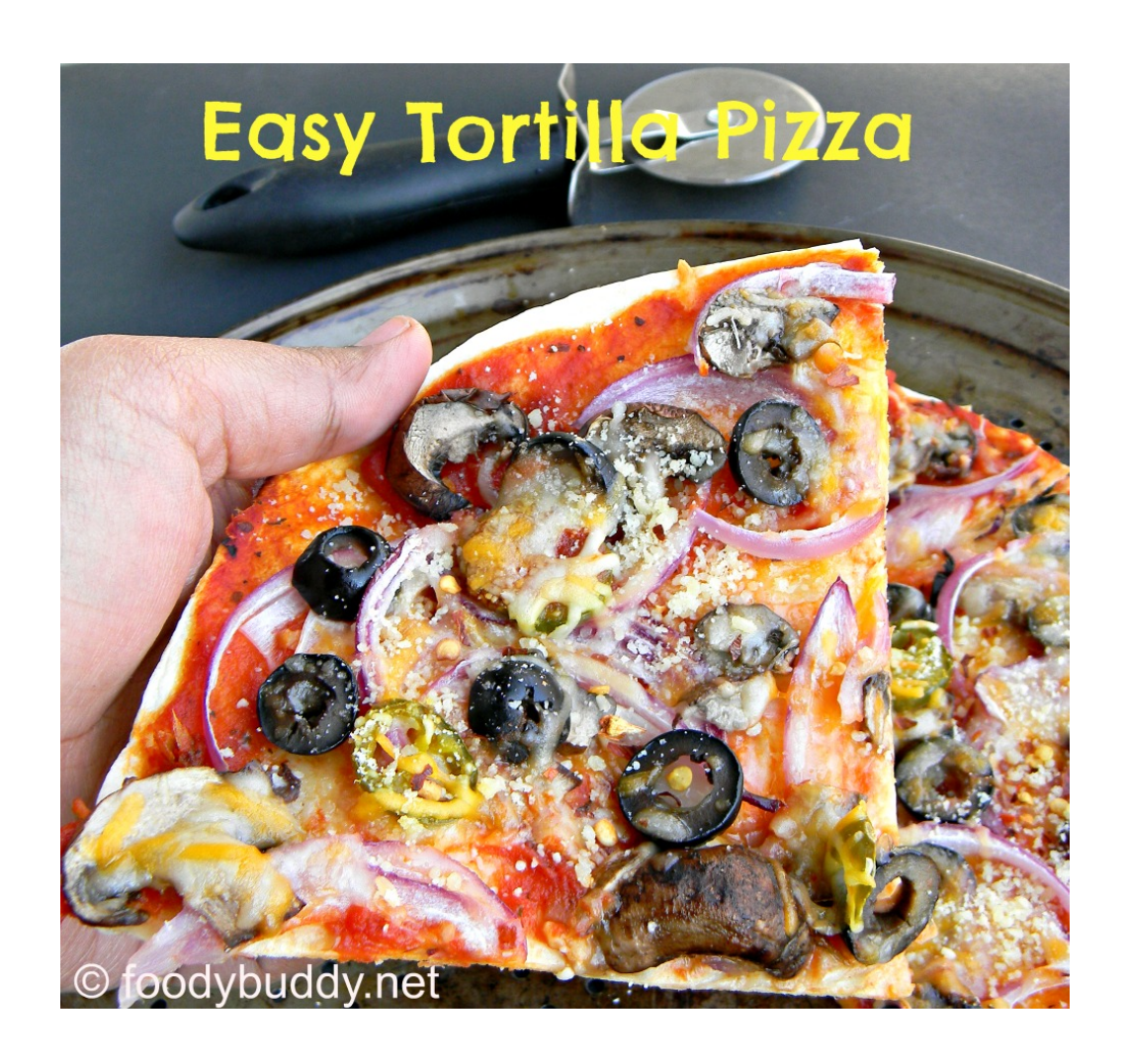
Tags: easy tortilla pizza, easy tortilla pizza recipe, tortilla pizza recipe, tortilla pizza, pizza recipe using tortilla, vegetarian tortilla pizza, veggie lovers pizza, cast iron pizza, simple tortilla pizza, crispy and quick tortilla pizza, thin crust pizza recipe, how to make tortilla pizza at home, prepare easy tortilla pizza, homemade pizza recipe, easy dinner pizza recipe