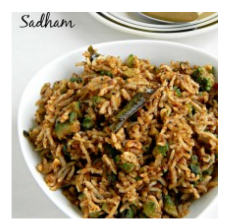
Save Print Prep time 10 mins Cook time 20 mins

Bittergourd Masala Rice Recipe / Pavakkai Sadham / Bittergourd Recipe