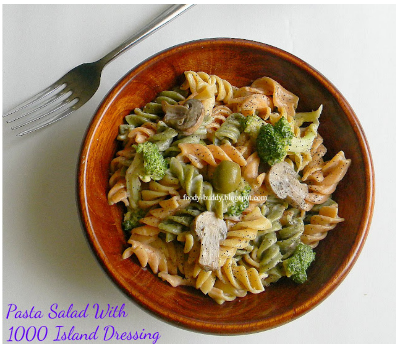
Pasta Salad With 1000 Island Dressing