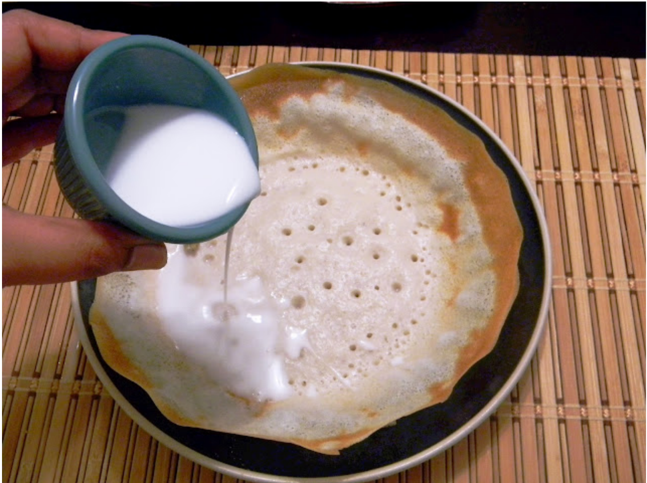
Coconut Milk and Veggie Korma

You can see " veggie korma recipe " in my blog.