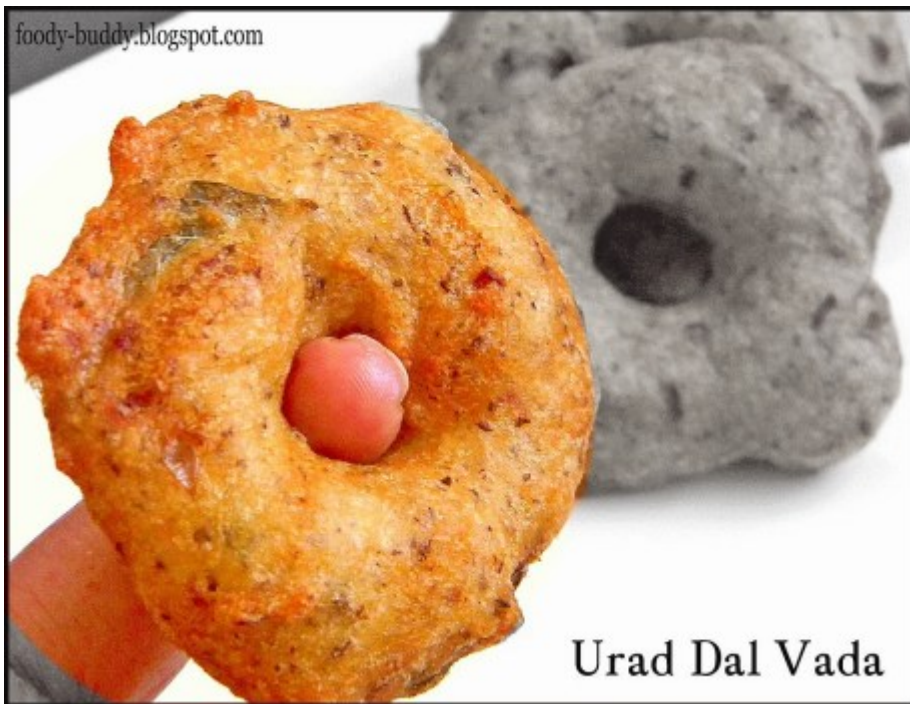
Urad Dal Vada