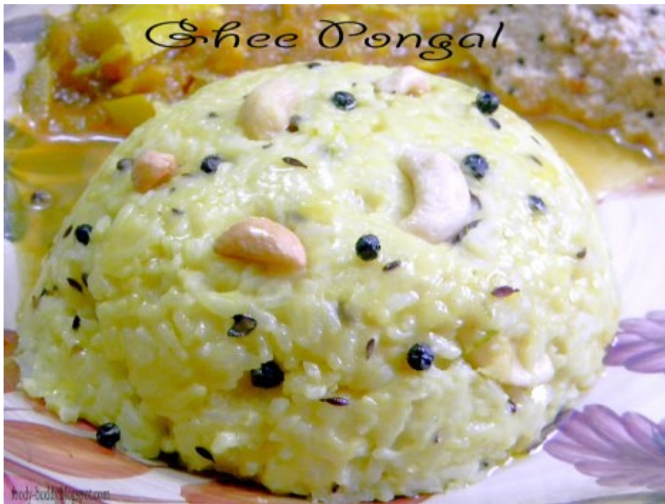
■ Ghee Khara Pongal