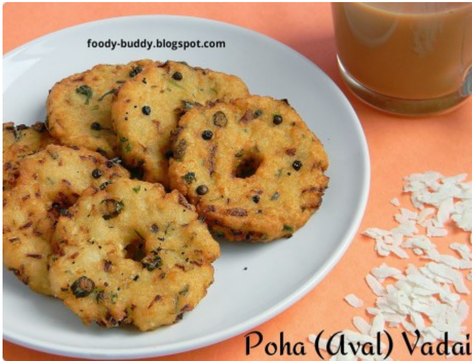
Poha (Aval) Vadai