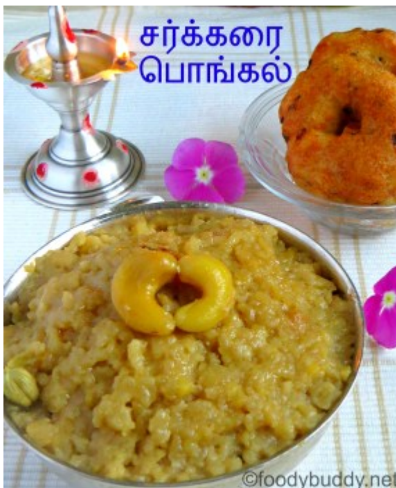
Sweet Pongal Recipe