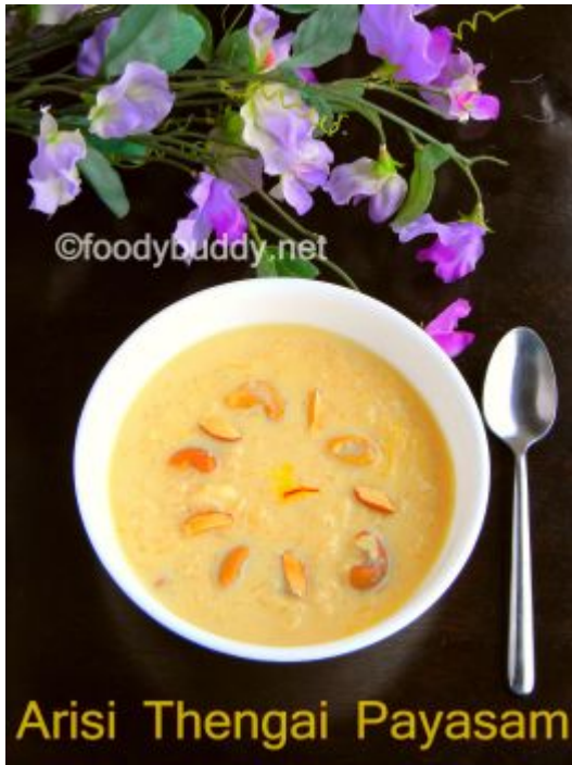
Arisi Thengai Payasam