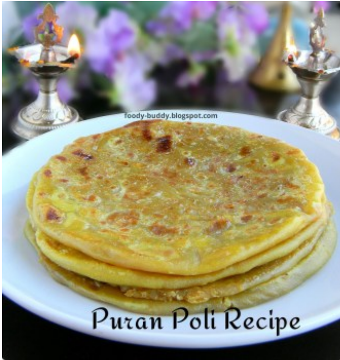
Puran Poli Recipe