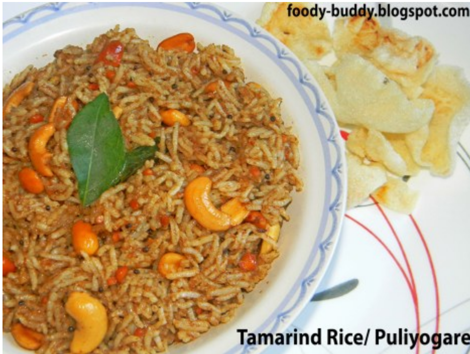
Tamarind Rice/ Puliyogare