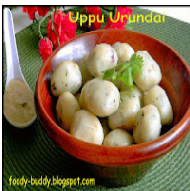
Uppu Urundai / Kara kollukattai