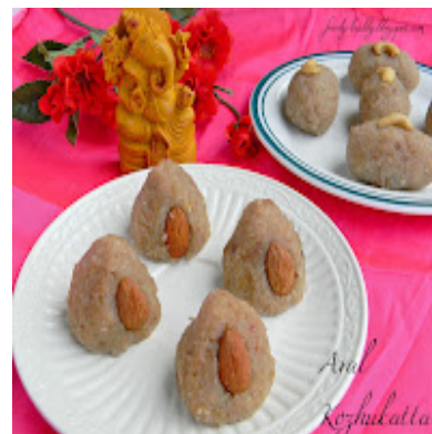
Sweet Aval Pidi Kozhukattai