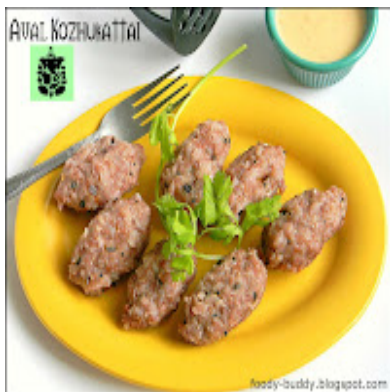
Red Aval Kara Kozhukattai

In 2013, Vinayagar Chaturthi falls on 9th of September. So here are the Vinayagar Chaturthi recipes from Foody-Buddy. Wishing you all Happy Vinayagar chaturthi...Click on the images to get the recipes.