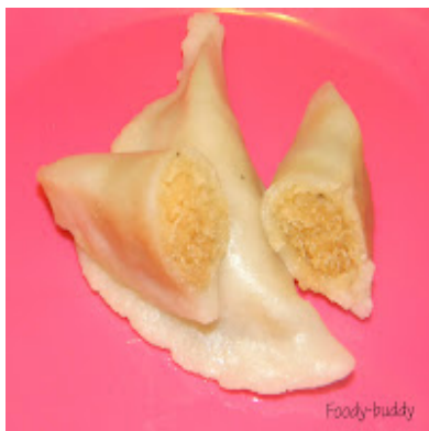
Coconut Poorna Kozhukattai