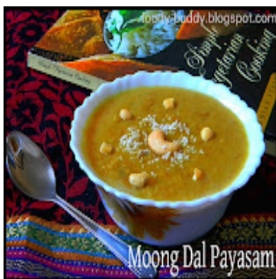
Moong Dal Payasam