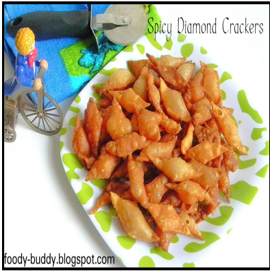
Spicy Diamond Crackers