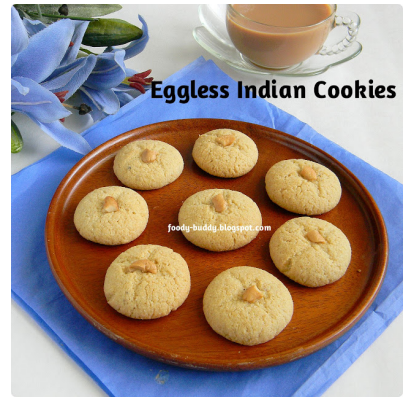
Eggless Indian Cookies