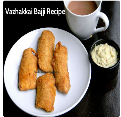
Vazhakkai Bajji Recipe