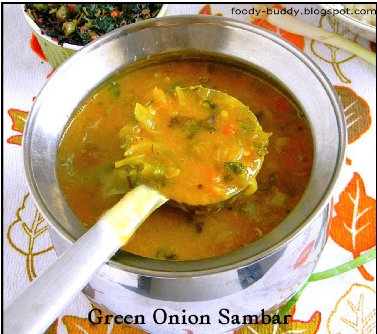
Green Onion Sambar