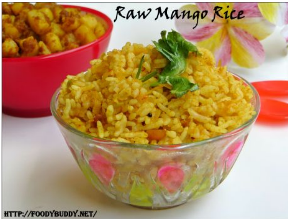
Raw Mango Rice