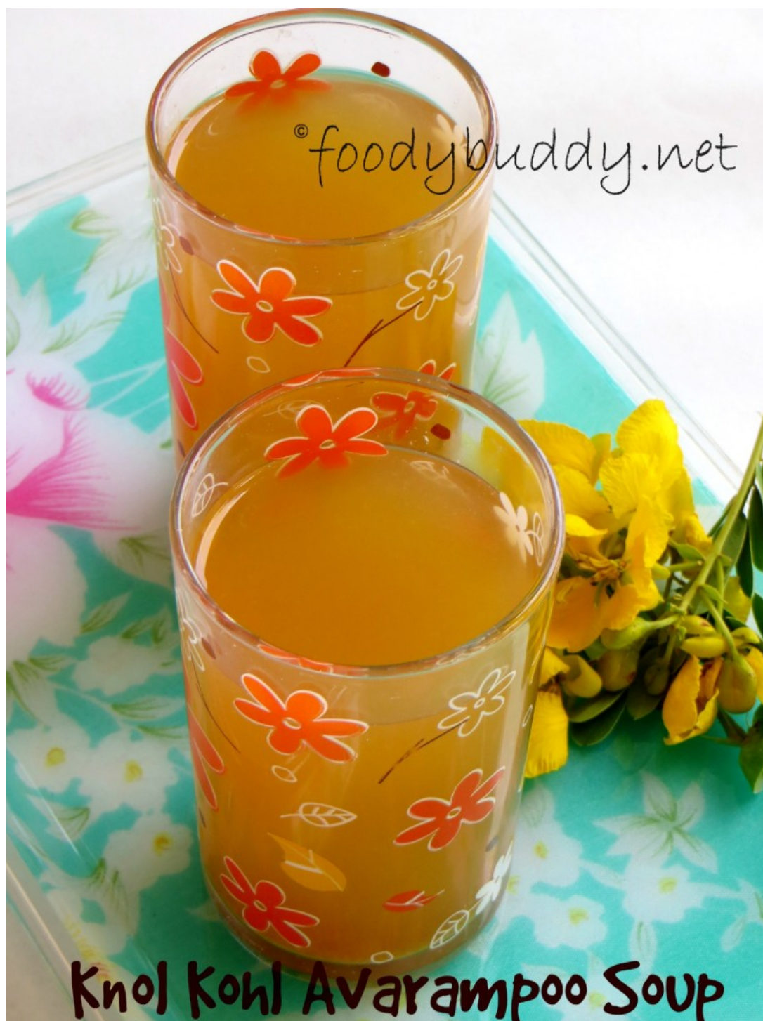
Knol Kohl Avarampoo Soup