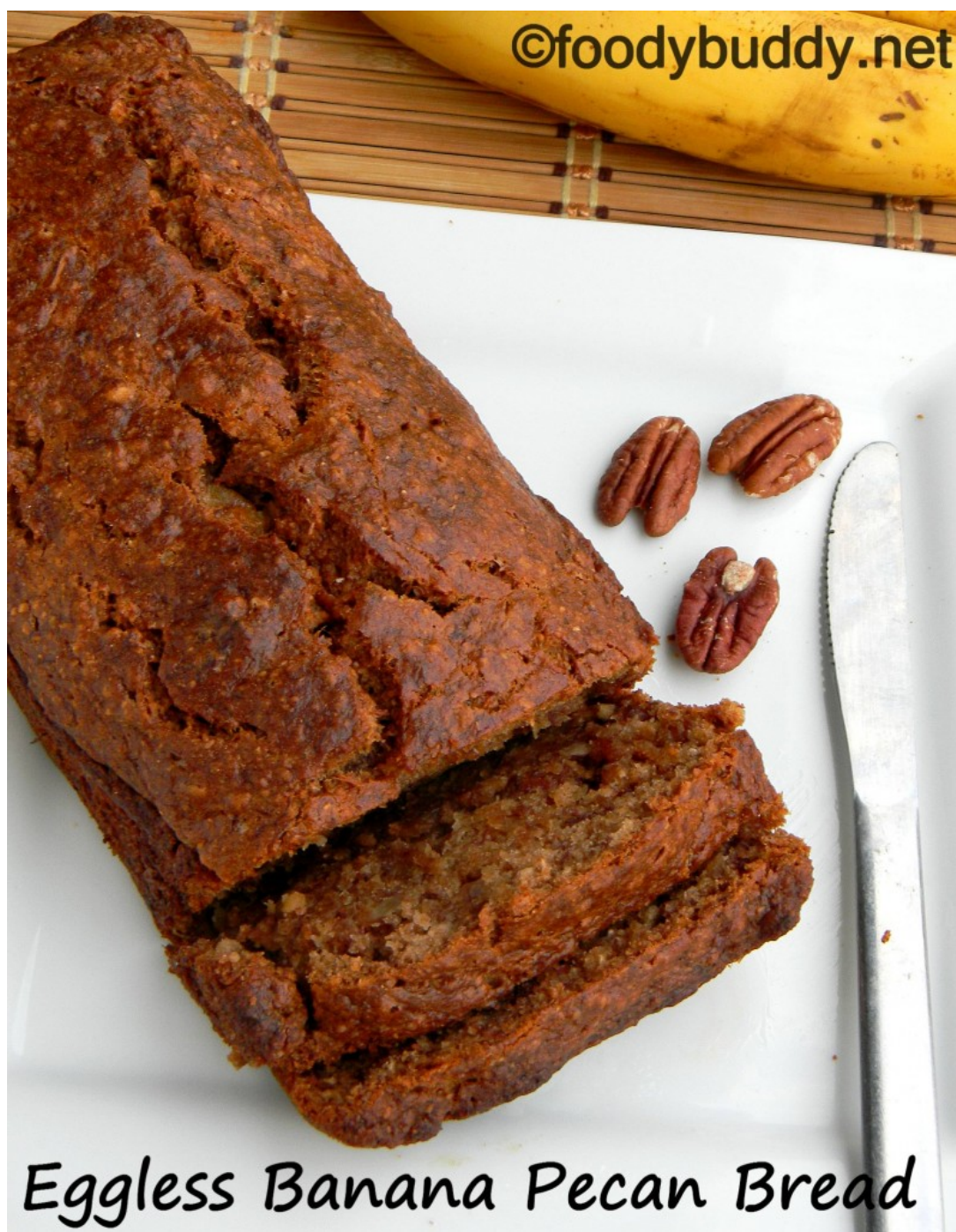
Eggless Banana Pecan Bread

This is the best and favourite banana bread recipe. This easy to make banana pecan bread are moist, soft and super delicious in taste..I really love this recipe and I have tried so many times. Everytime it comes out good and tasty. I saw this recipe in king arthur whole wheat flour bag. My love to