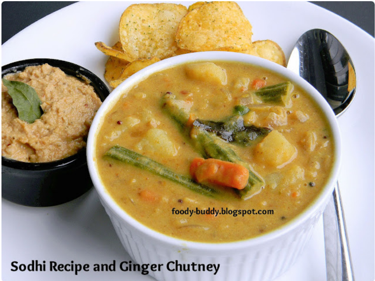
Sodhi Recipe and Ginger Chutney