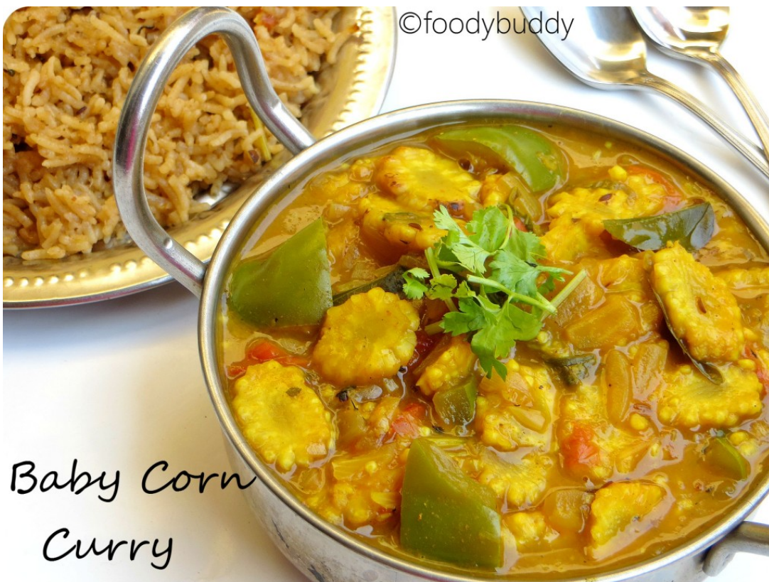
Baby Corn Curry