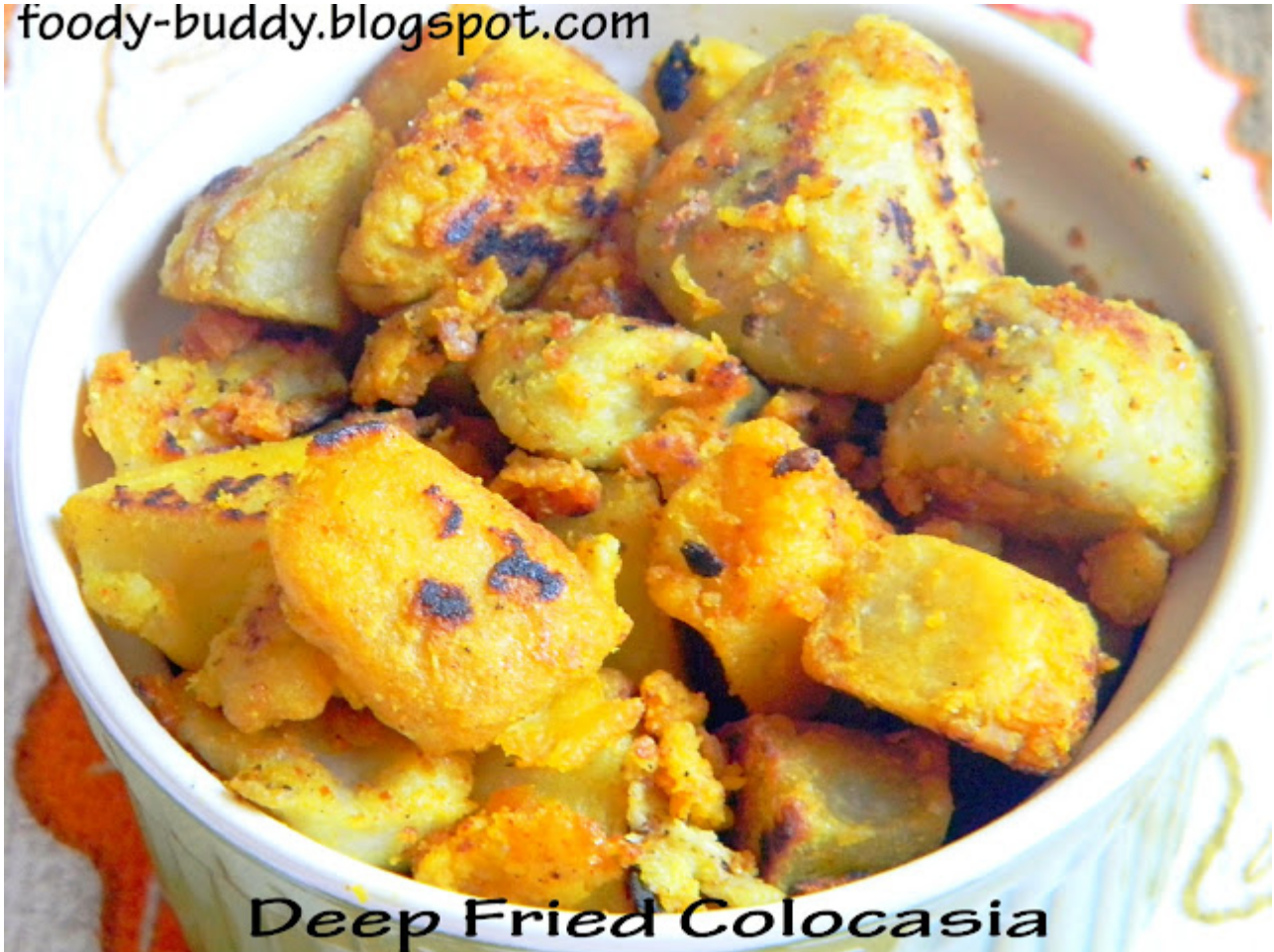
Deep Fried Colocasia