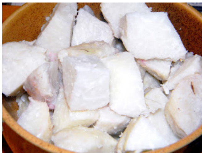
COLOCASIA – CUT INTO CUBES