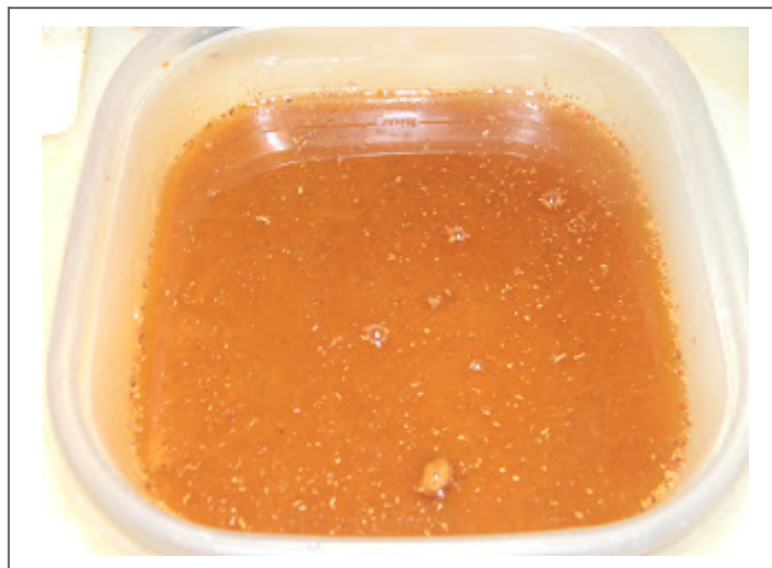
TAMARIND JUICE AND SPICE POWDER