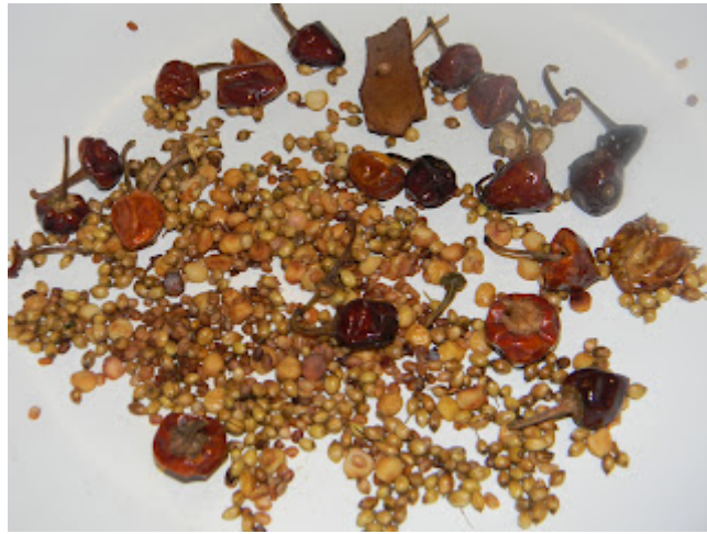
OIL ROAST THE SPICES