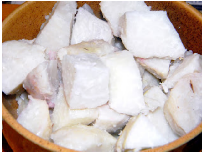
COLOCASIA – CUT INTO CUBES