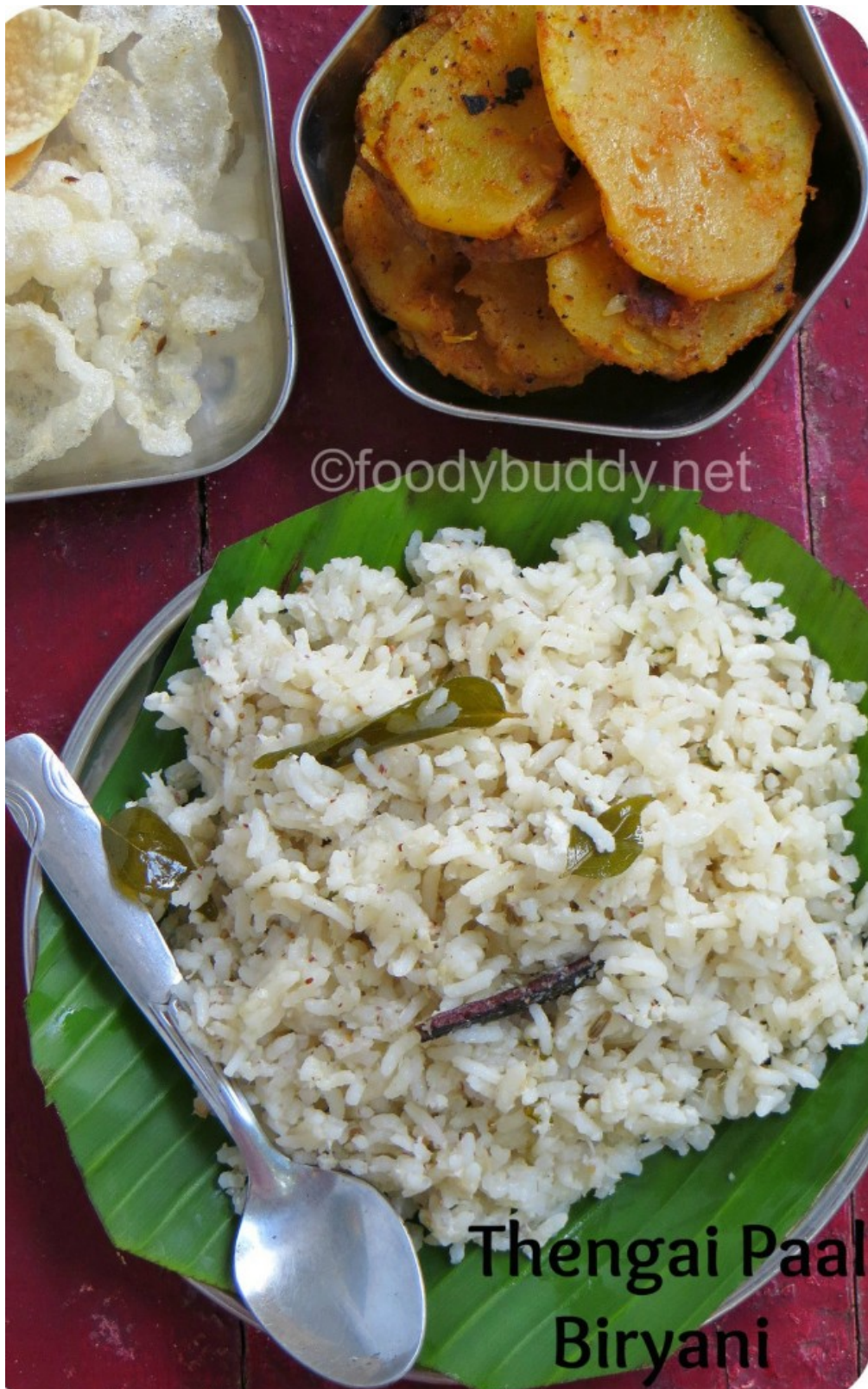
Thengai Paal Biryani

Tags: coconut milk biryani recipe , thengai paal biryani , how to make coconut milk biryani recipe , plain biryani with coconut milk , biryani recipes , coconut milk recipes , south indian biryani , easy biryani with coconut milk , thengaipaal