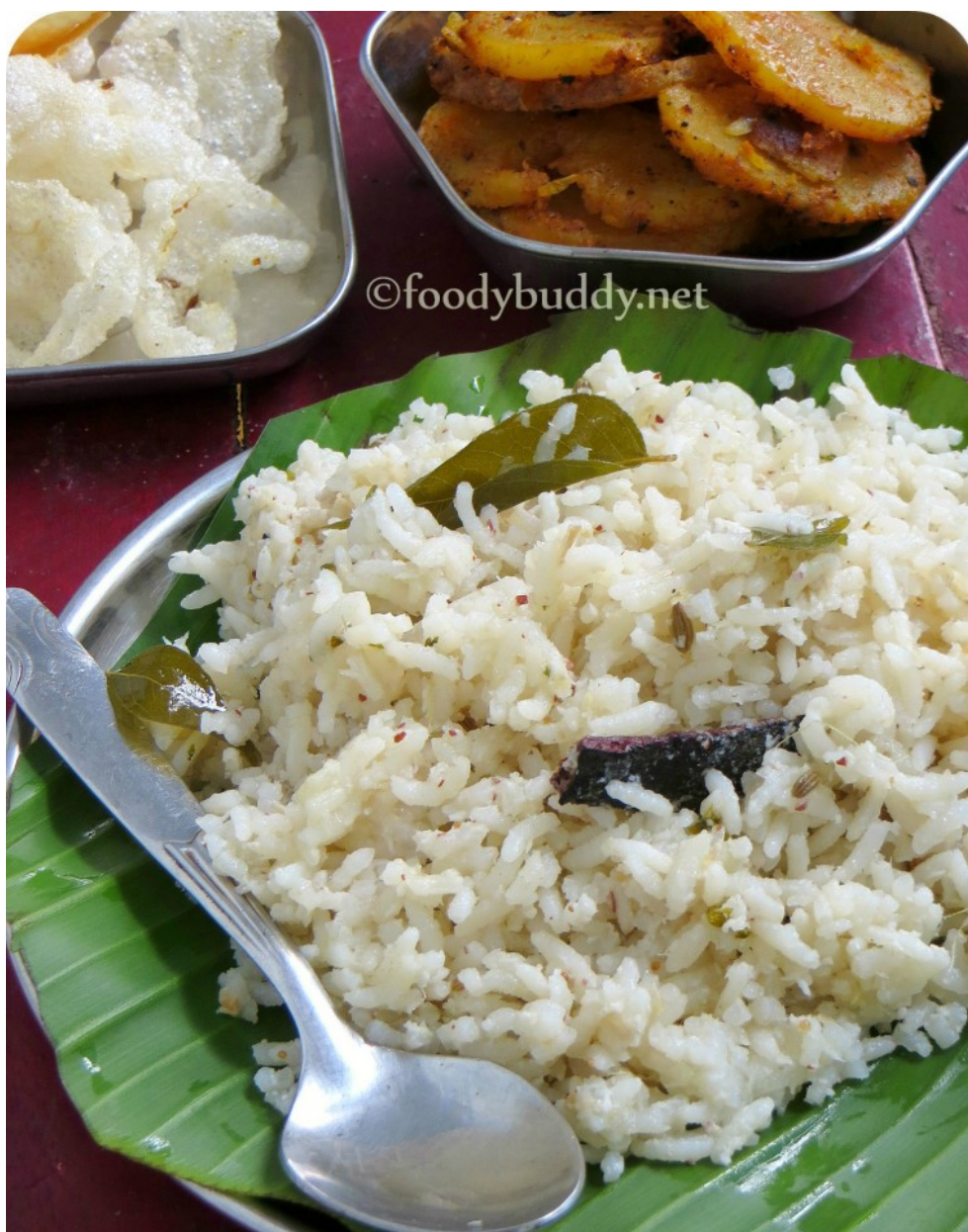
Coconut Milk Biryani