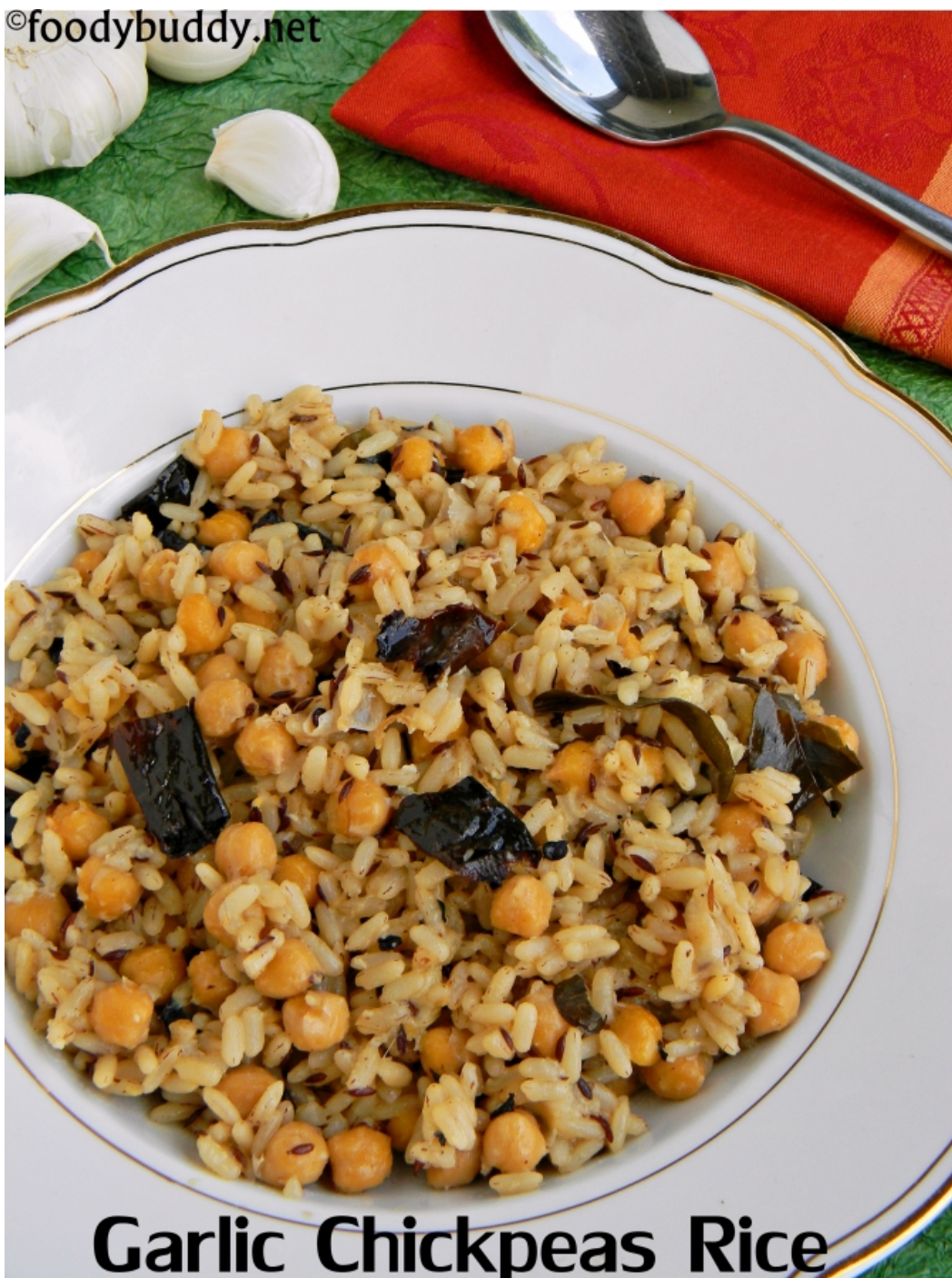
Garlic Chickpeas Rice