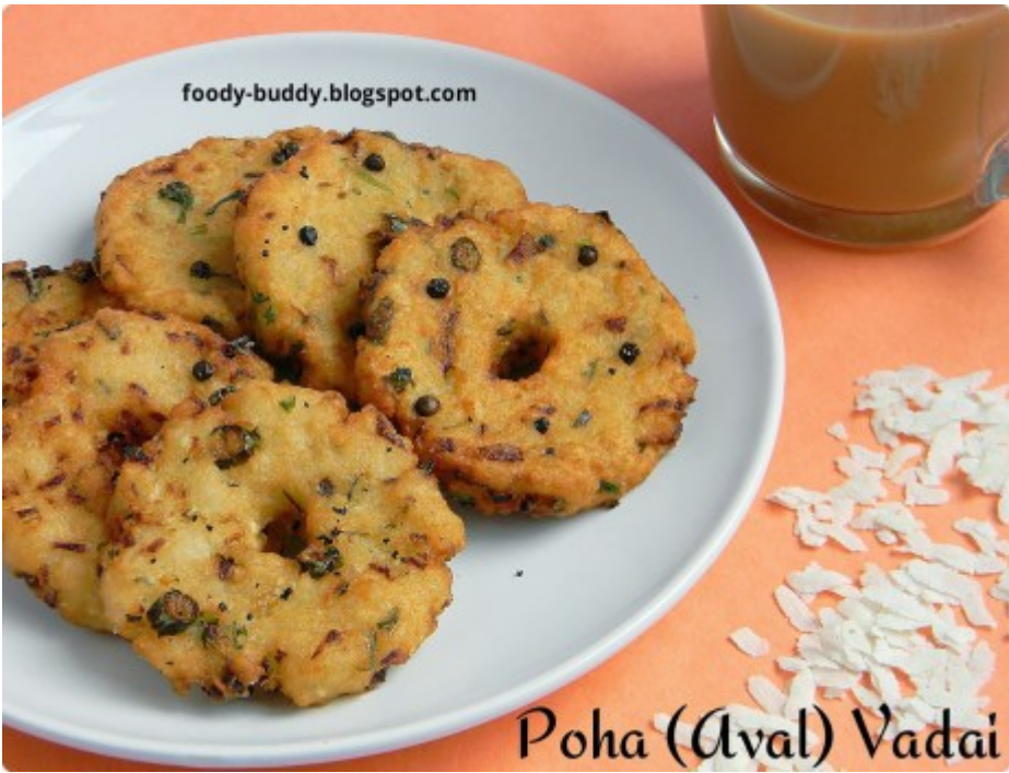
Poha (Aval) Vadai