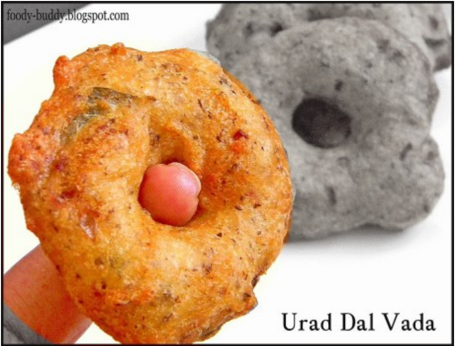
Urad Dal Vada