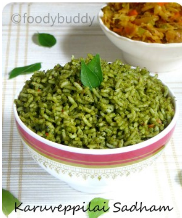
Curry Leaves Rice