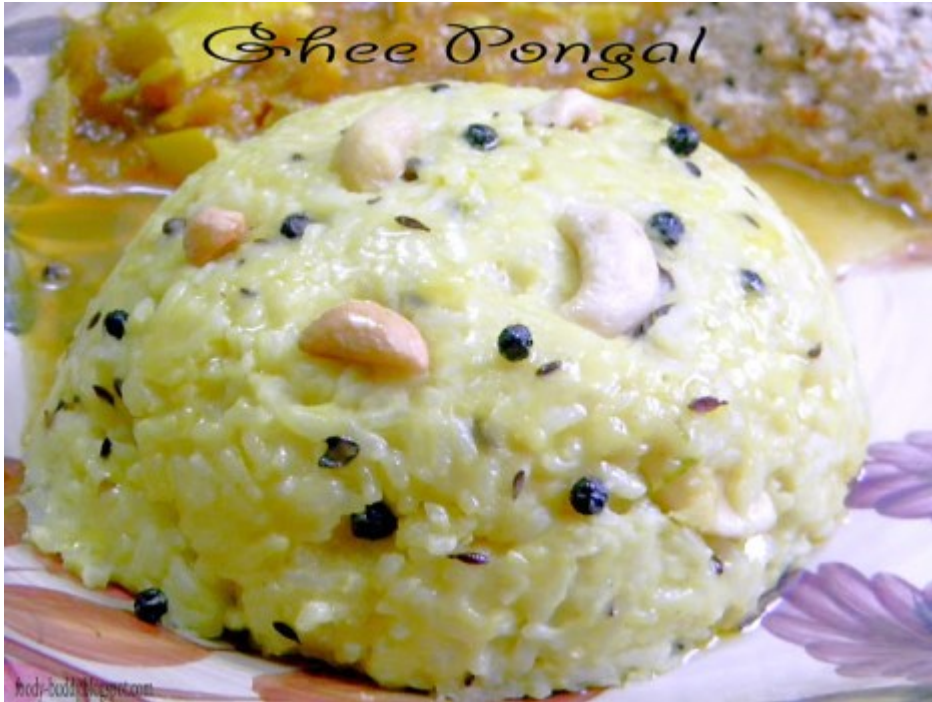
Ghee Khara Pongal