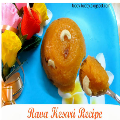
Rava Kesari Recipe