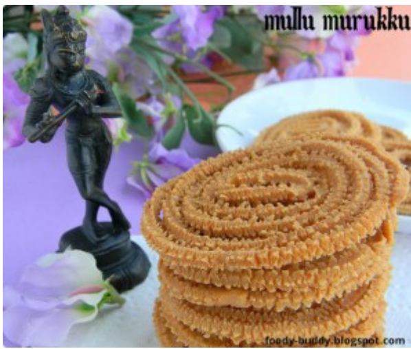
■ Mullu Murukku