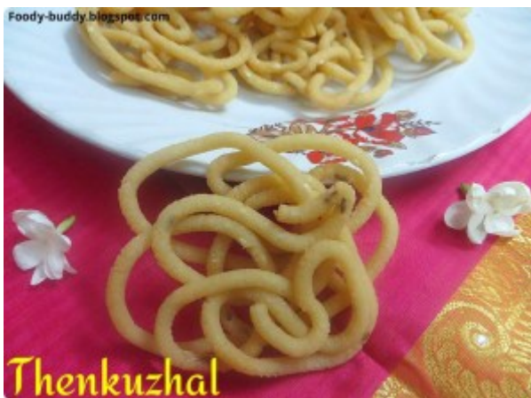
■ Thenkuzhal Murukku