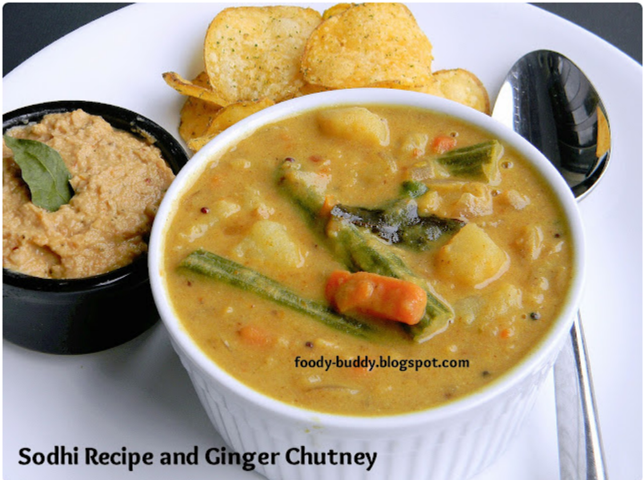
Sodhi Recipe and Ginger Chutney