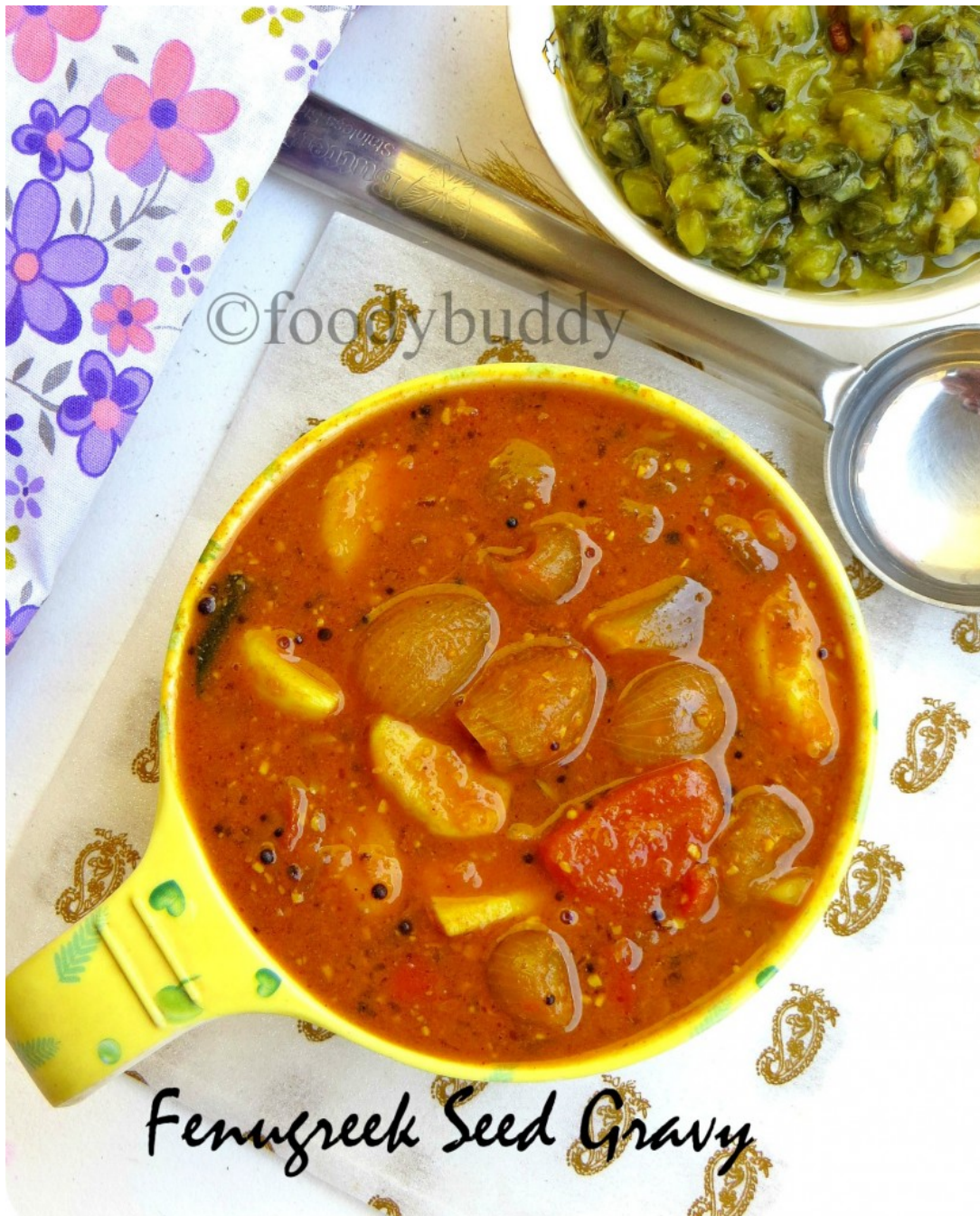
Fenugreek Seed Gravy

Tags : kuzhambu Recipe , Vendhaya kuzhambu , venthaya kuzhambu recipe , vendhaya kuzhambu recipe , how to make vendhaya kuzhambu , how to prepare venthaya kulambu , how to make fenugreek seeds gravy , methi seeds curry , south Indian kuzhambu recipe , tamilnadu kulambu recipes .