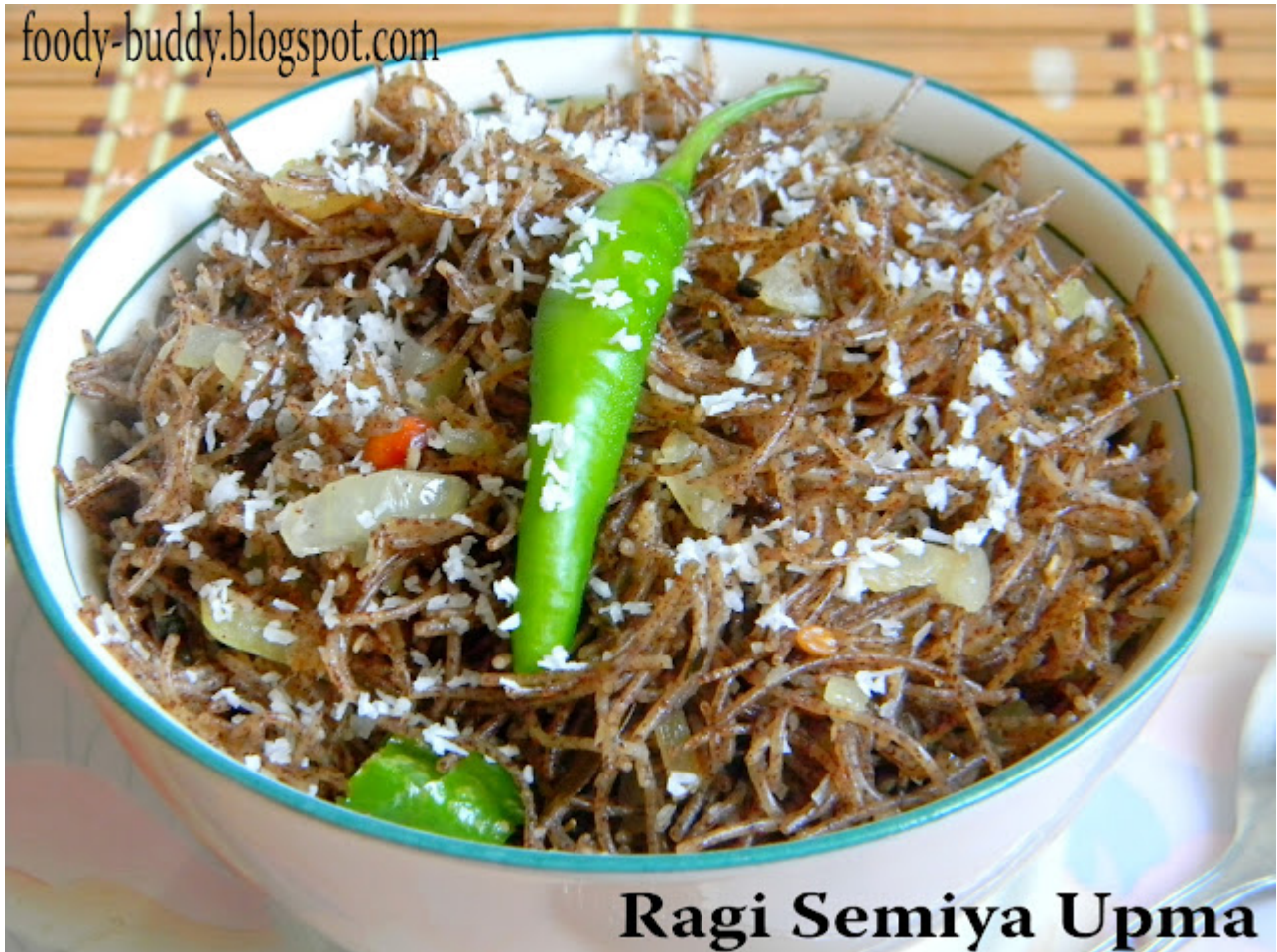
Ragi Semiya Upma