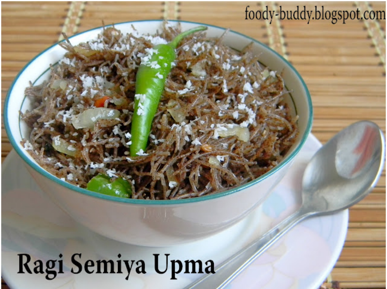
Ragi Semiya Upma