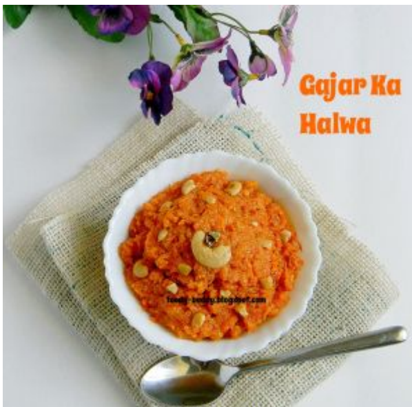
Microwave Carrot Halwa