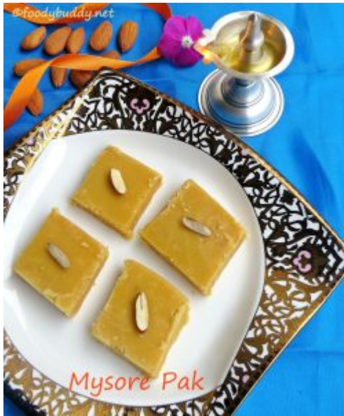
Badam Mysore Pak