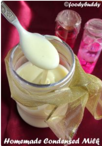
Condensed Milk Recipe