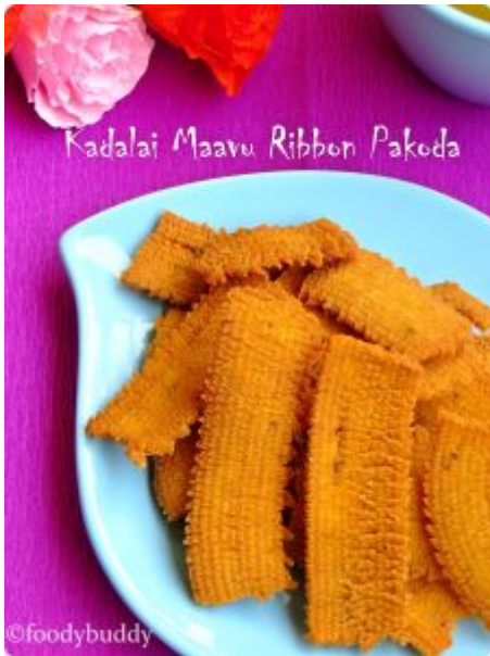
Kadalai Maavu Ribbon Pakoda