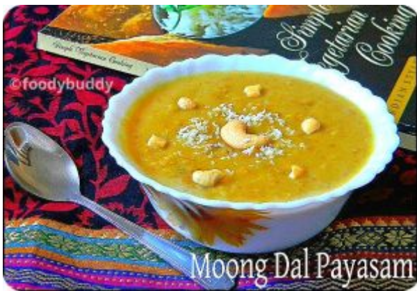
Moong Dal Payasam