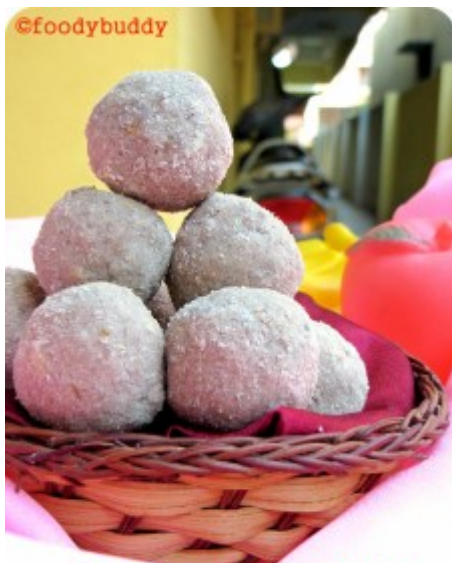
Red Aval Ladoo Aval Ladoo