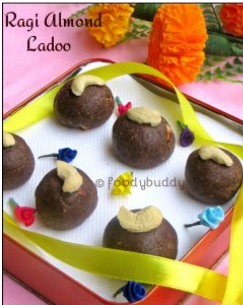
Ragi Almond Ladoo