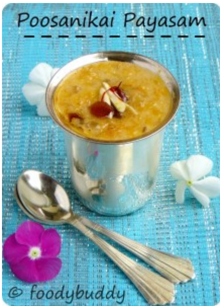
Yellow Pumpkin Payasam