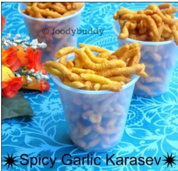
✳️ Spicy Garlic Karasev ✳️