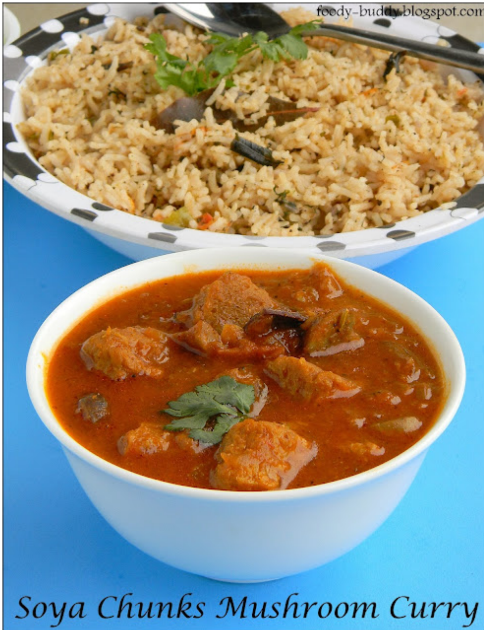
Soya Chunks Mushroom Curry

It looks like non-vegetarian dish, right ? But it has a healthy meat replacement ingredients, Soya Chunks (Meal Maker) curry with mushroom. Both soya chunks and mushroom are rich in protein and very nutritious. Soya Chunks / Soy Nuggets curry is a flavorful and aromatic dish that goes well with chapathi , biryani or pulao . I am not a big fan of soya chunks but my husband loves it. So I used to make this meal maker korma once a month for him. Soya chunks are soft and